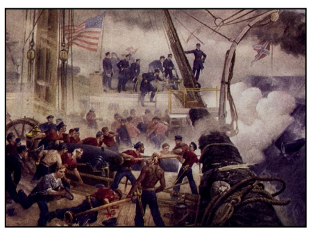
Farragut at Mobile Bay

When the USS Tecumseh rapidly sank after hitting one of the Confederate mines, Farragut urged the stalling Federal naval assault forward with "Damn the torpedoes!"