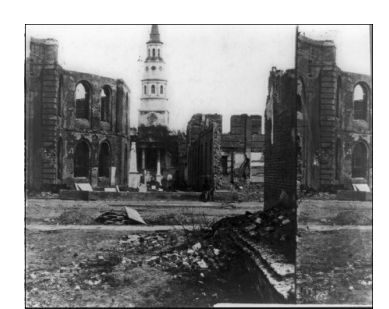
Destruction in Charleston

Many of the city's most famous landmarks, including Institute Hall, where South Carolina's ordinance of secession had been ratified the previous year, were burned.