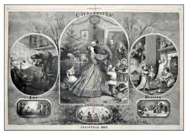
Harper's Weekly, Dec. 26, 1863, edition

The Civil War saw its third Christmas in 1863. The soldiers on both sides understandably yearned for their homes and families.