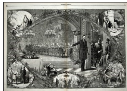
Harper's Weekly , Dec. 31, 1864, Edition

The Civil War saw its fourth Christmas in 1864. The soldiers on both sides understandably yearned for their homes and families.