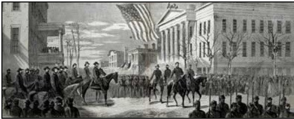
Sherman in Savannah

In a note sent to President Lincoln, Sherman wrote: "I beg to present you as a Christmas gift, the city of Savannah, with one hundred and fifty heavy guns and plenty of ammunition, and also about twenty-five thousand bales of cotton."