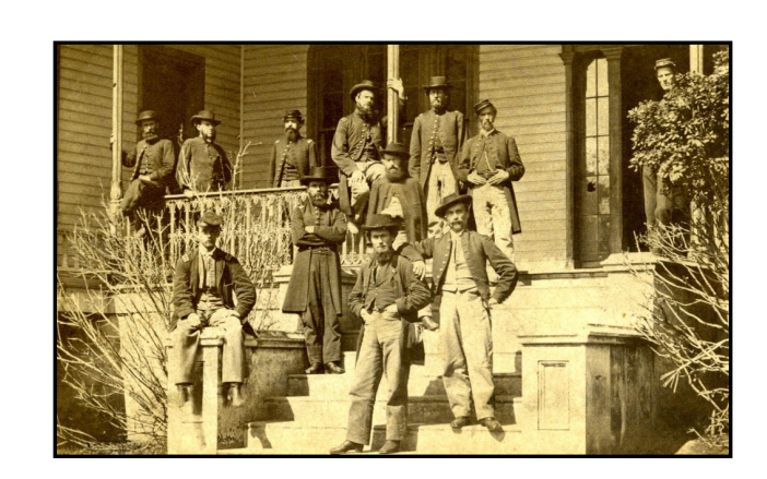
23rd Iowa Infantry Headquarters

About 13,000 men from the Hawkeye State were killed or died from their wounds or disease during the conflict.