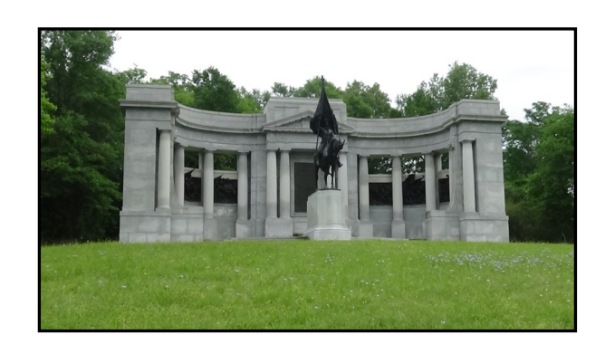
Iowa Monument, Vicksburg

lowans served in many of the significant battles of the Civil War and more than 50 Medals of Honor were awarded to men from the state.