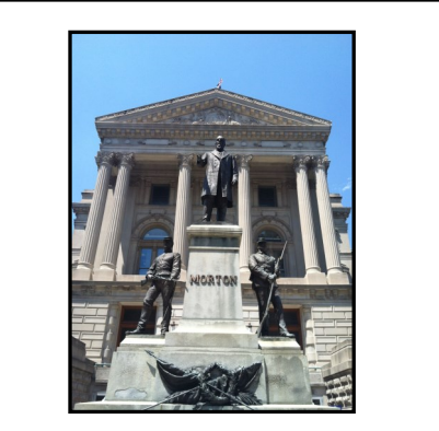
Morton Statue, Indianapolis

In 1860, Indiana had 1,350,428 residents. About 208,000 men from the Hoosier State served in the United States army, navy, and marines. Although they primarily served in the Western Theater, men from Indiana fought in most of the major battles of the war from Philippi, Va., in June 1861 to Palmetto Ranch, Texas in May 1865. Indiana suffered 25,028 war-related deaths, of which 7,243 were men killed in action.