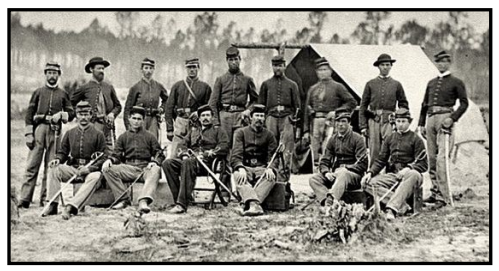
19th Indiana Volunteer Infantry Regiment

Indiana provided some 129 regiments of infantry, 13 cavalry regiments, and 27 batteries of artillery to the Union cause. In addition, thousands of men from the state volunteered for the Indiana Legion, the state's home guard. More than 35 percent of the Hoosiers who joined the Union army became casualties.