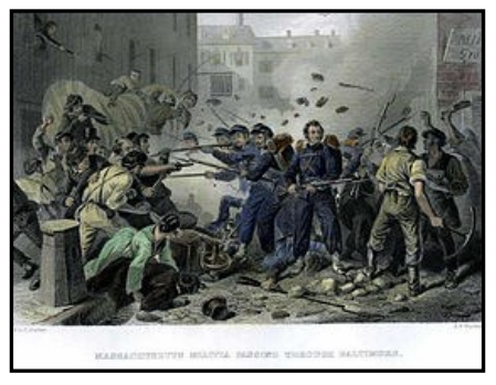
6th Mass Attacked in Baltimore

Massachusetts provided 68 regiments of infantry, two of which were formed with black men, along with five cavalry regiments and numerous artillery units.