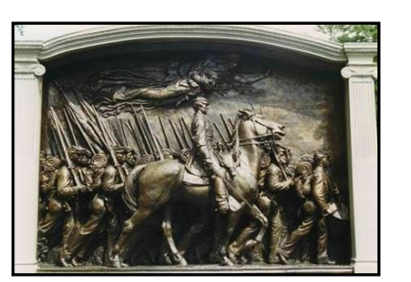
54th Mass Monument, Boston

About 150,000 men from Massachusetts served in the Union forces and nearly 14,000 of them were killed in battle or died of disease during the Civil War. Two regiments of colored infantry came from the state, including the famed 54th Massachusetts.