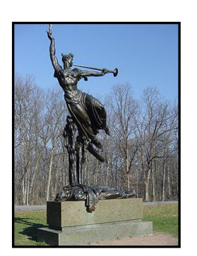
Louisiana Monument, Gettysburg

In 1860, Louisiana had a population of 708,002. Of those, nearly half, or 331,726 people, were slaves. The Pelican State also had one of the largest free black populations in the country. Louisiana was the sixth state to join the Confederacy, seceding through a vote by convention delegates.