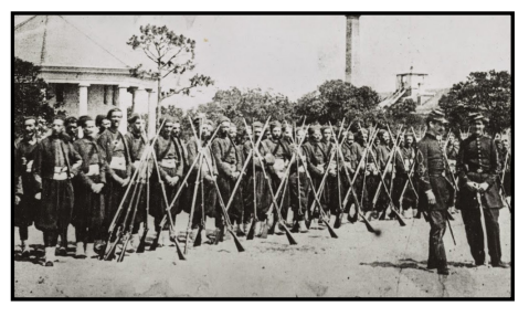
Tigers in New Orleans, 1861

Dozens of infantry, militia, artillery, and cavalry units from Louisiana served the Confederate cause, about 56,000 men. More than 3,000 of them were killed or wounded during the Civil War. The state also was the source of men who fought in the Union army, including soldiers in several black units. More than 24,000 black men served in the Union army, the most from any state.