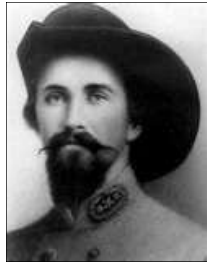
John Hunt Morgan

The raid alarmed the pro-Union military government of Kentucky, slowed the advance of Maj. Gen. Don C. Buell on Chattanooga, Tenn., and was a factor in the decision to launch a Confederate offensive into the state that fall.