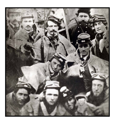
The 1st Virginia, 'Richmond Grays' in late 1859

Virginia provided some 64 infantry regiments and several other units to the Confederate cause, along with dozens of cavalry and artillery units.