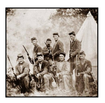
Members of the 8th Kansas, Co. E

Kansas provided 11 infantry regiments, nine cavalry regiments and several artillery batteries to the Union cause. A number of militia regiments and two units of Colored Volunteer Infantry also were raised in the Jayhawk State.