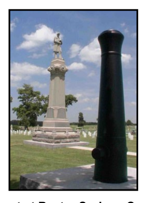
Monument at Baxter Springs Cemetery

More than 20,000 Jayhawkers enlisted in the Union army. Nearly 8,500 soldiers from Kansas became casualties in the Civil War and the state had the highest mortality rate of any in the Union.