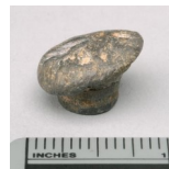
Bullet removed from one of his wounds.