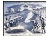
Firing Squad at Palmyra, Mo.