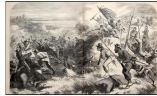
Battle of Island Mound

For the first time during the Civil War, on Oct. 29, an African-American unit saw combat. The 1st Kansas Colored Volunteers was primarily comprised of black fugitives from Arkansas and Missouri and had been mustered into service the previous August.