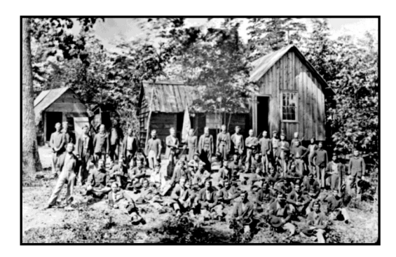
21st Michigan Infantry

More than 90,000 men from the Great Lakes State served in Union forces. Michigan provided some 30 infantry regiments, including the First Colored, 102nd U.S. Infantry, 11 regiments of cavalry, as well as other units of engineers and artillery to the Union cause. Men from Michigan were nicknamed "wolverines" after the state's 1835 fight with Ohio due to their ornery disposition. About 15,000 men from the Great Lakes State were killed or died from their wounds or disease during the Civil War.