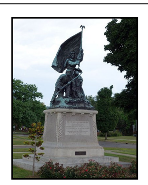
Soldiers and Sailors Monument, Jackson, MI

In 1860, Michigan had a population of 749,113. No battles of note were fought in the state during the Civil War, but because it bordered Canada, it was threatened by Confederate raiders.